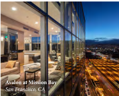
Avalon at Mission Bay San Francisco, CA

AVALONBAY COMMUNITIES, INC. is an equity REIT in the business of developing, redeveloping, acquiring and managing multifamily communities primarily in New England, the New York/New Jersey metro area, the Mid-Atlantic, the Pacific Northwest, and Northern and Southern California. We focus on leading metropolitan areas in these regions that we believe are characterized by growing employment in high wage sectors of the economy, higher cost of home ownership and a diverse and vibrant quality of life. We believe these market characteristics offer the opportunity for superior risk-adjusted returns over the long-term on apartment community investments relative to other markets that do not have these characteristics