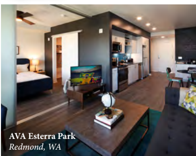
AVA Esterra Park Redmond, WA