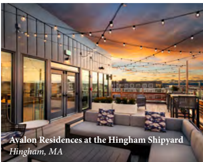
Avalon Residences at the Hingham Shipyard Hingham, MA