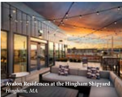
Avalon Residences at the Hingham Shipyard Hingham, MA