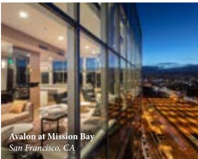
Avalon at Mission Bay San Francisco, CA

AVALONBAY COMMUNITIES, INC. is an equity REIT in the business of developing, redeveloping, acquiring and managing multifamily communities primarily in New England, the New York/New Jersey metro area, the Mid-Atlantic, the Pacific Northwest, and Northern and Southern California. We focus on leading metropolitan areas in these regions that we believe are characterized by growing employment in high wage sectors of the economy, higher cost of home ownership and a diverse and vibrant quality of life. We believe these market characteristics offer the opportunity for superior risk-adjusted returns over the long-term on apartment community investments relative to other markets that do not have these characteristics