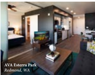
AVA Esterra Park Redmond, WA