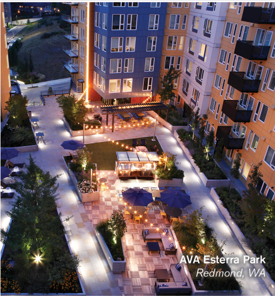
AVA Esterra Park Redmond, WA