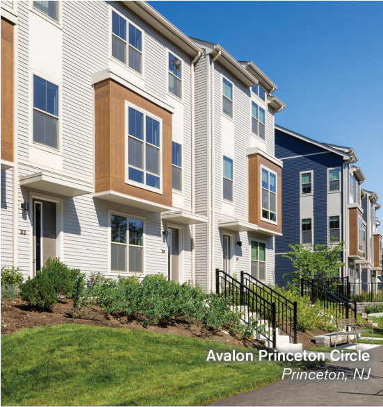
Avalon Princeton Circle Princeton, NJ