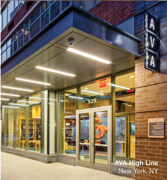
AVA High Line New York, NY