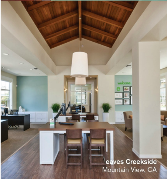
eaves Creekside Mountain View, CA