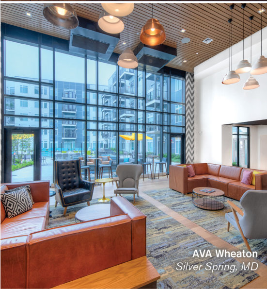
AVA Wheaton Silver Spring, MD