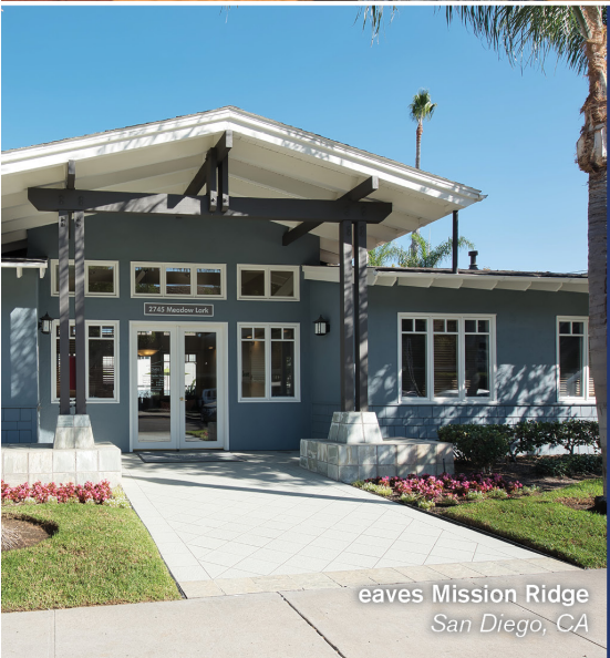
eaves Mission Ridge San Diego, CA